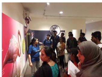
1) Students and amateurs in the exhibition hall receiving information from experts