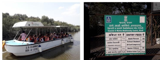
Boat ride for flamingo watch

Currently there is 24 seater and 8 seater boats are available and use of life jackets is compulsory. Boating timings are subjected to tide . Boat has Guides which have been trained by BNHS . There is availability of ‘Birds of Thane Creek ’book available at the souvenir shop . Boat fees is rs 300 in weekdays and rs 400 on weekends. Additional facilities like mangrove trail using board walk are available.