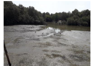
2) Mangrove Mud flats and waders

Mangrove ecosystem are one of the richest biodiversity areas inhabited by diverse group of flora and fauna. It includes various habitats like core forest, litter forest floor, mud flats, coral reefs, sea grass ecosystem, and water bodies like rivers, bays and creeks. To live in areas of lack of oxygen and high salinity, mangroves exhibit various adaptations like succulent leaves, sunken stomata, areal breathing roots called pneumatophores, viviparity etc (ISFR 2019, n.d.)