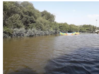
1) Mangroves at the CMBC, Airoli

coastal areas. Mangrove ecosystem plays very important role on lives of coastal and marine species and local community is dependent on them for livelihood.