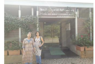
Coastal and marine biodiversity center, Airoli

GIZ Project helped to establish Coastal and Marine Biodiversity Center (CMBC) in Airoli, Thane on 30 th April