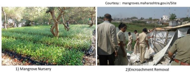
1) Mangrove Nursery