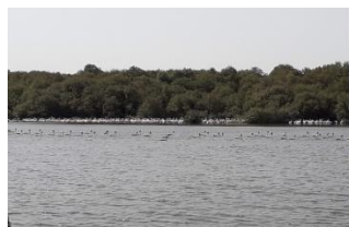
1) Flamingos (Far View)