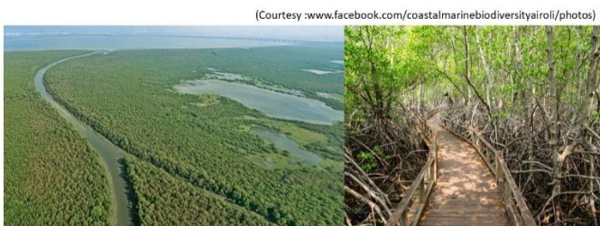
1) Mangrove Cover in Mumbai