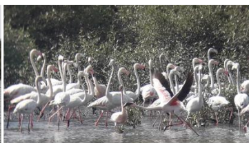
2) Flamingos (Closer View)

There is mangrove flat of 1690 hectars between Vashi and Airoli areas .Boat ride tour of one hour around 10 kms of mangrove beginning from Airoli to Vashi and back takes tourists to the areas close of flamingos via boating .