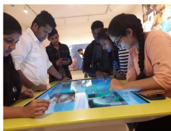
2) Interactive screen for learning biodiversity